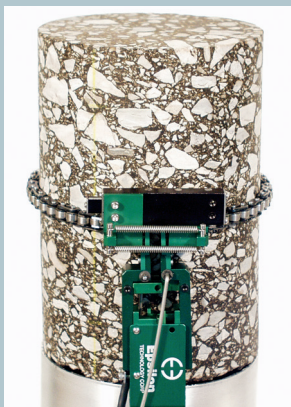
Model 3544 with a 4 inch diameter specimen

See the electronics section of this catalog for available signal conditioners and strain meters.