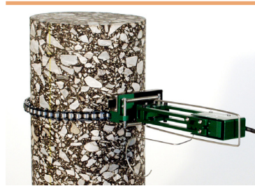
Model 3544 in a horizontal body style

Designed for concrete and rock compression testing or for compression tests on other large samples. This model may be used simultaneously with the Model 3542RA axial extensometers.