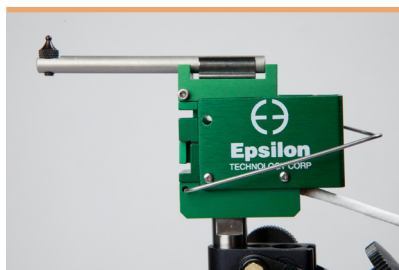
Model 3540 with 1 mm measuring range

Widely used for measuring deformations in three and four point bend tests, compression tests and a variety of general purpose deformations. These strain gaged devices come with a magnetic base for easy mounting.