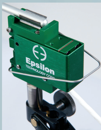
Model 3540 deflectometer